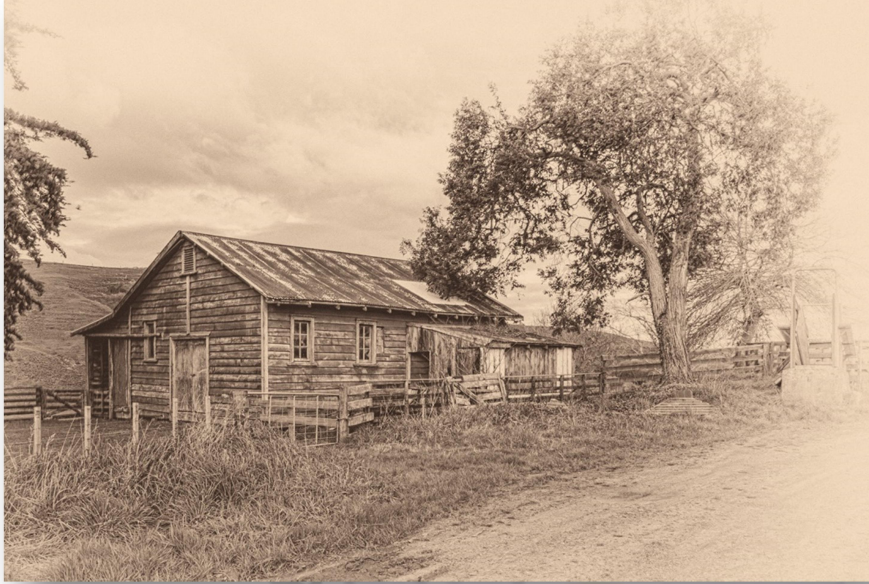
© Aston Moss – BEST Projected Image