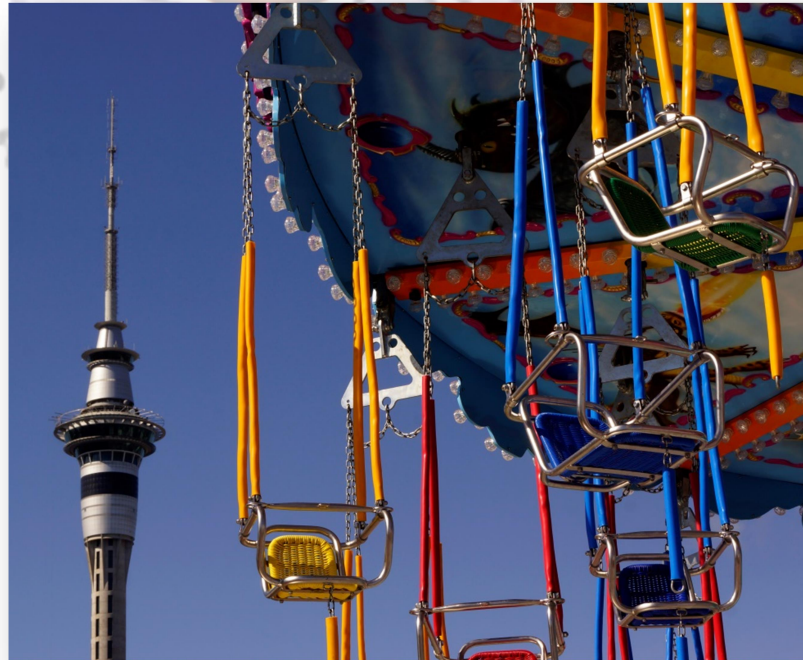
© Kate Snow – BEST Print